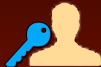
Public Key Alice